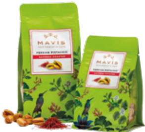
Sizes: 100gr. / 250 gr.

For the first time, nuts enter the gourmet category thanks to Mavis . With their impeccable presentation, they offer great versatility for use in luxury hotels and premium food services.