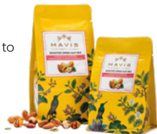
Sizes: 100gr. / 250 gr.

Salty cocktail: Pistachio, cashew, almond, hazelnut and pumpkin seed.