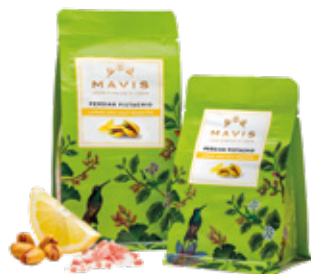
Sizes: 100gr. / 250 gr.

With hints of citrus and salt, Mavis presents its roasted pistachios with lemon and sea salt , which go perfectly with a good tequila or rum at the pool or at the beach club .