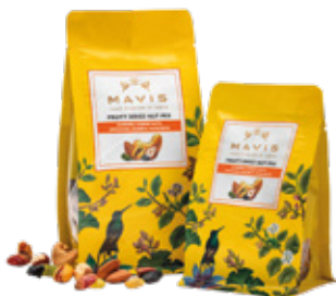
Sizes: 100gr. / 250 gr.

Sweet cocktail: Pistachio nuts, cashew nuts, almonds, hazelnuts and raisins.