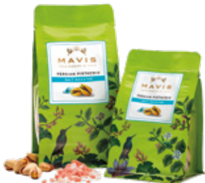
Sizes: 100gr. / 250gr.

A more traditional version is the salt-roasted pistachios , which preserve the roasted aroma with their perfect saltiness. They are ideal with a vermouth in the lobby or at the hotel bar .